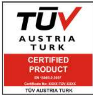
TÜV AUSTRIA TURK CERTIFIED SERVICES