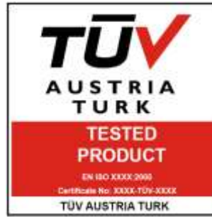
TÜV AUSTRIA TURK TESTED PRODUCT