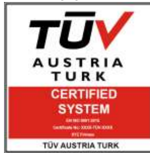
TÜV AUSTRIA TURK CERTIFIED SYSTEM