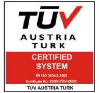
TÜV AUSTRIA TURK CERTIFIED SYSTEM